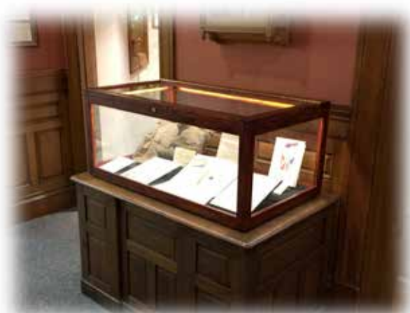
New Groton History Center display