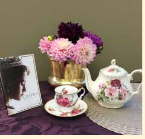
October Encore! It was requested that we host The Crown Tea Series twice each year because many people were unable to reserve a seat for the winter event.

Ladies and gentlemen enjoyed home baked scones and tea breads with butter & jam, plus fresh brewed tea in teapots kept warm with tea cozies. The tables were set with elegant tablecloths, china cups and saucers, and centerpiece platters offered a sampling of cookies and candy. We enjoyed some fun during intermission by playing a trivia game and learning historical tidbits from that era.